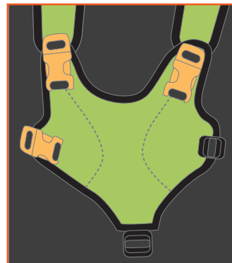
5 POINT CHEST PLATE